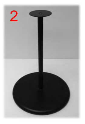
Place Support Plate on top of the Base Rod