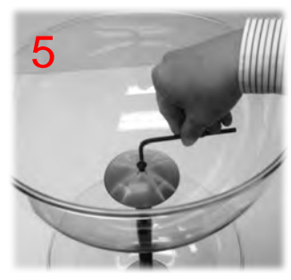
Screw the Top Bowl in place using the Top Bowl Bolt and Allen Key provided