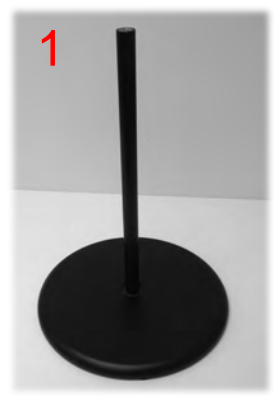
Screw Base Rod into the base, ensure Rod is tight