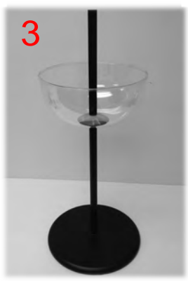
Place a Bowl onto the Support Plate and attached Bowl & Plate by screwing in a Bowl Rod