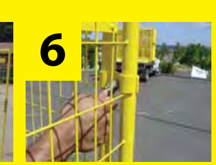
Repeat for the remainder of Connect panels to each other the panels using the panel clamps.