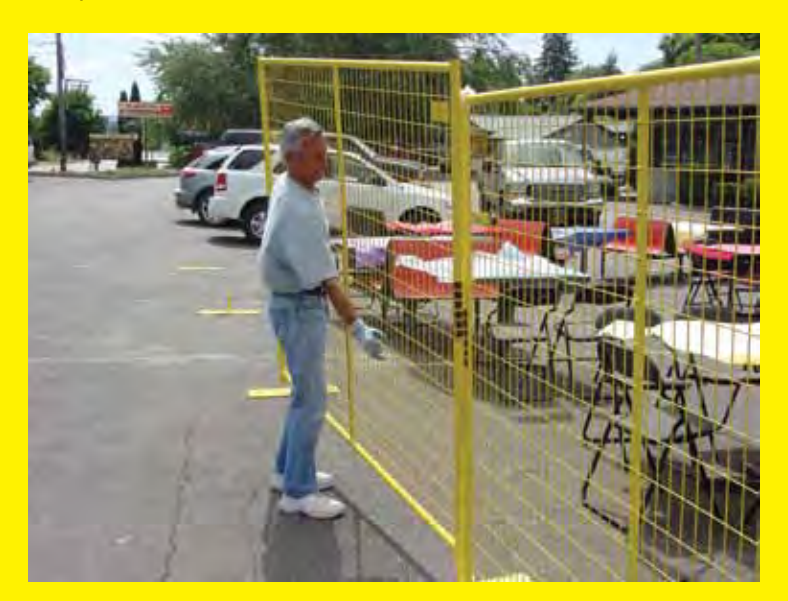
Simply place panel on top of bases and the fence begins to take shape

At only 37-pounds, each panel can be moved and set-up by one person.