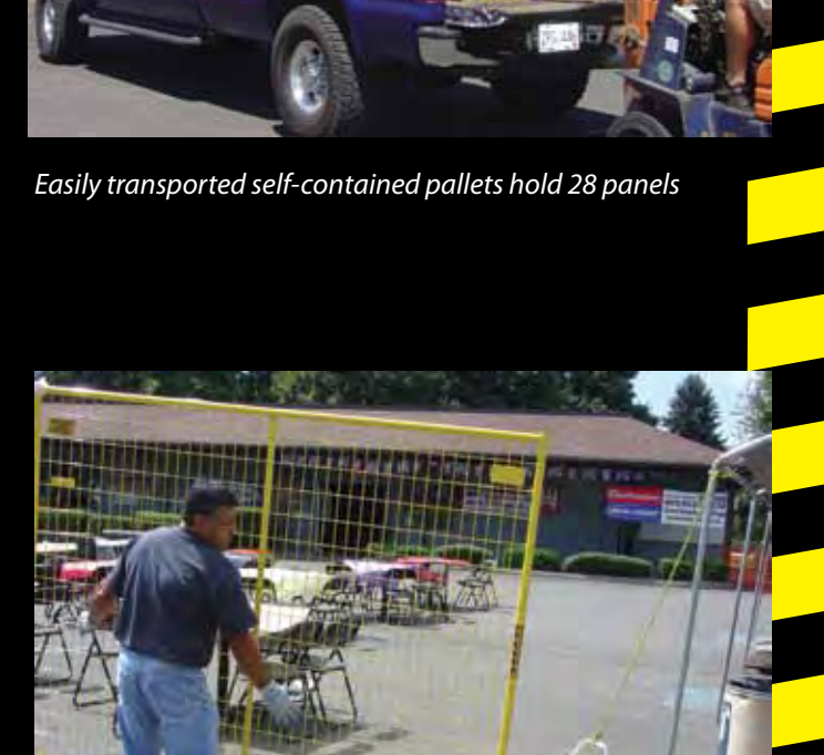
Easy, one-person set-up

Visually appealing alternative to chain-link fence