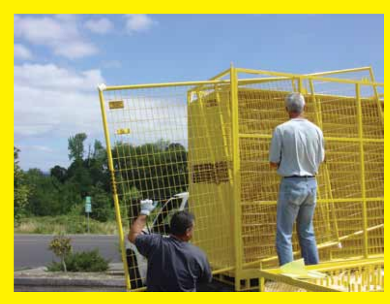
Everything needed for 210 linear feet of fence is contained in a single pallet that is easily transported to the job site