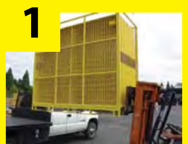
Load pallet into truck and drive to the job site.