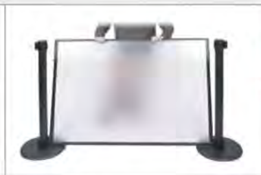
Pivot the panel into place.