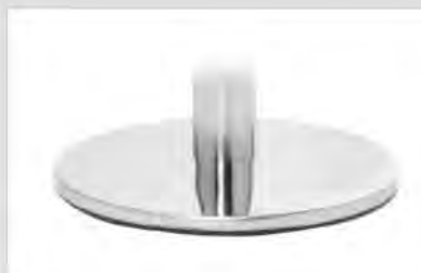
14" Diameter Portable Base