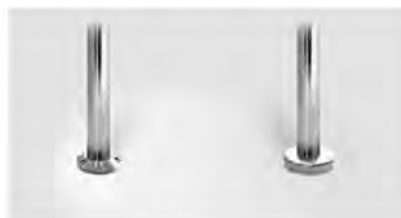
5" flange for permanent surface mounting.