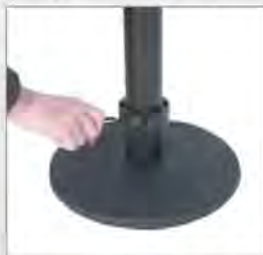
Attach collars to post bottoms.