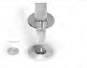
Floor socket for removable mounting.