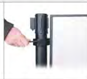
Attach collars to post tops.