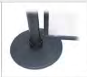
Insert frame lugs into collars.